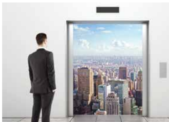
Figure 1: Connecting the car to the outside world