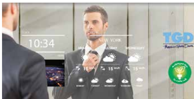
Figure 2: Gateway rendering

Gateway provides new solutions. It hides the whole hardware behind a mirror, avoiding the above-mentioned risks. It provides architects and designers a new opportunity to create elegant lift cars. The “wow effect” is also added, deriving from the new communication and digital signage system. It also opens the door to multiple and real-time management of communication on every car from a single remote point. Its enhanced communication and interactive features are in accordance with Lift Directive 2014/33/EU and Machinery Directive 2006/42/EC.