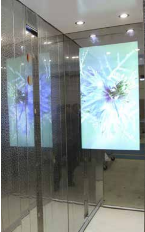
Figure 3: First Gateway delivered; photo courtesy of the Wittur Group

becomes a real interface that displays a variety of content that can be managed on three different levels.