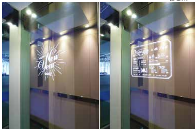
Figure 5: Communication examples