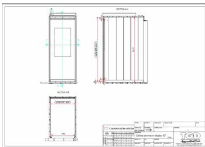
Table 4: Mirror car integration for 42-in. model (dimensions: 820 x 2,137 mm)