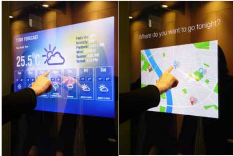
Figure 6: Touchscreen feature

than just have an audio conversation) might reduce panic and fear, and better understand communication from the safety/assistance service.